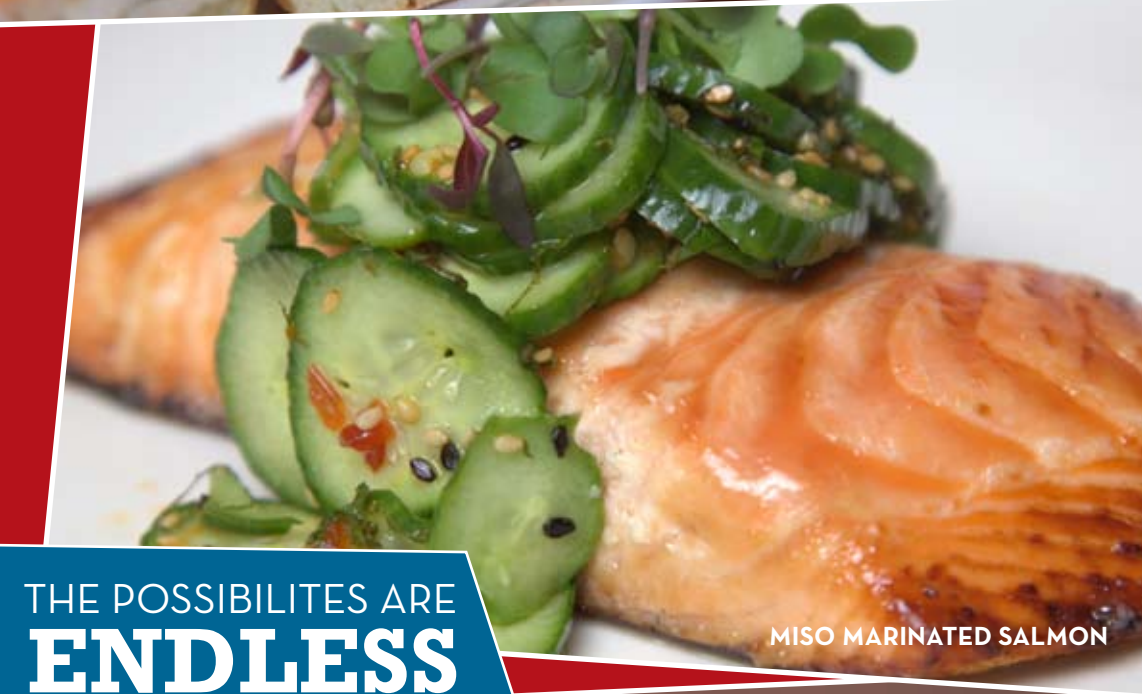
MISO MARINATED SALMON