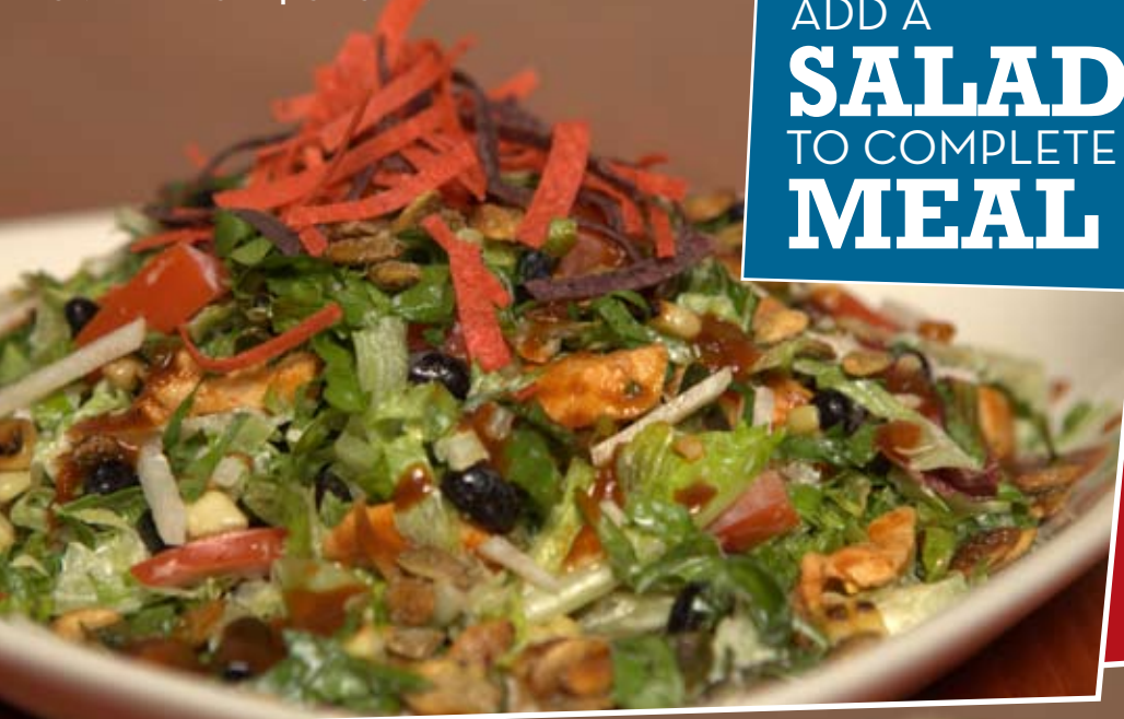
BABY WEDGE SALAD