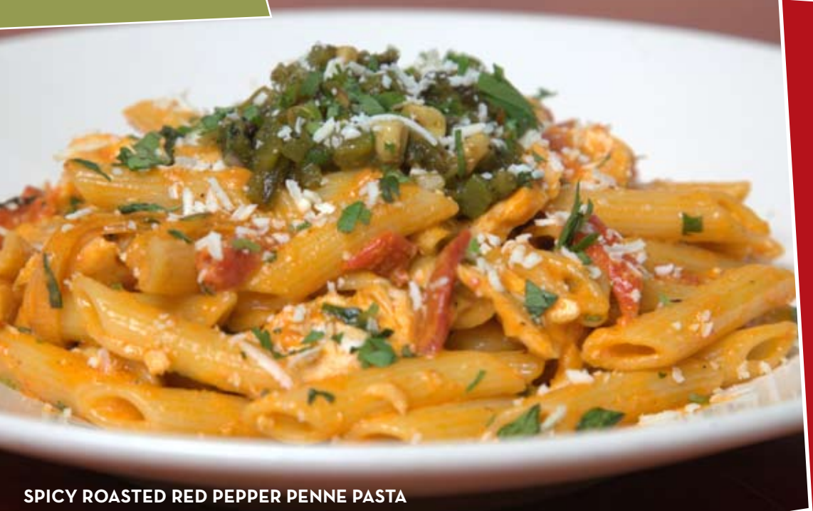
SPICY ROASTED RED PEPPER PENNE PASTA