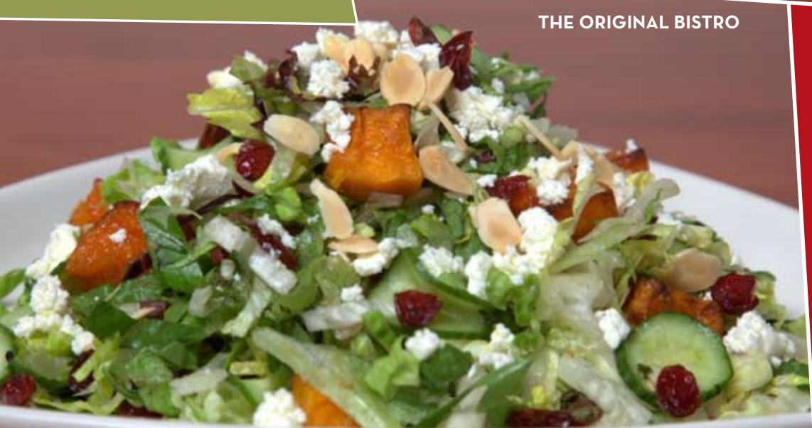
THE ORIGINAL BISTRO