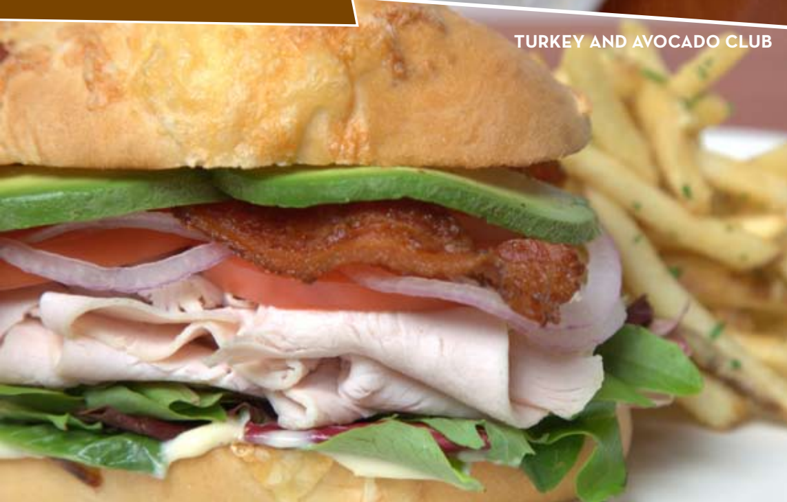
TURKEY AND AVOCADO CLUB