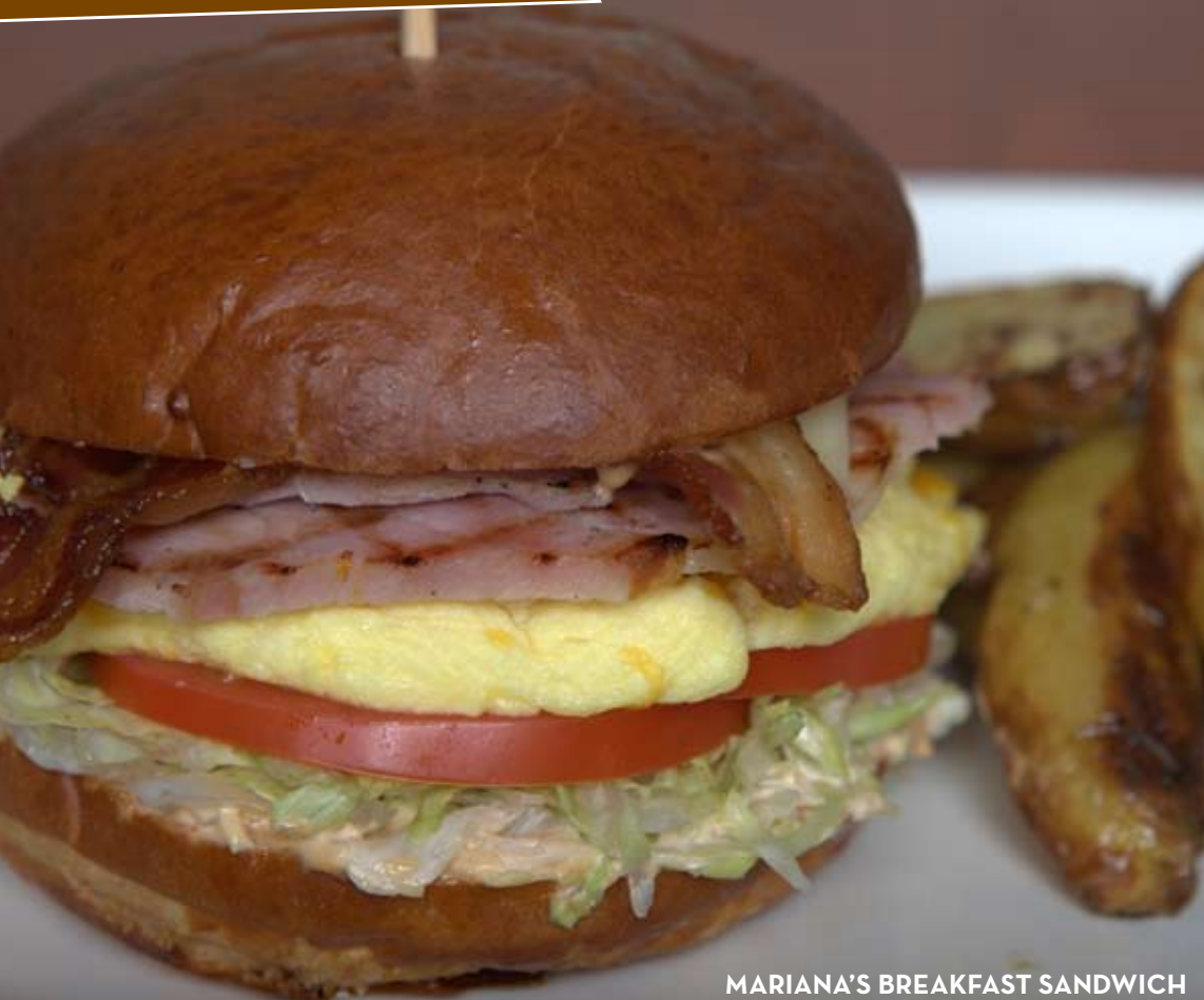
MARIANA'S BREAKFAST SANDWICH