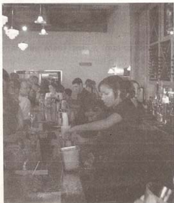
Bartenders mix up a variety of cocktails, including the Cable Car, already a favorite.